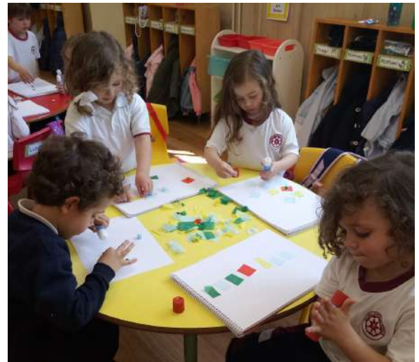
K1 CREATING ART!