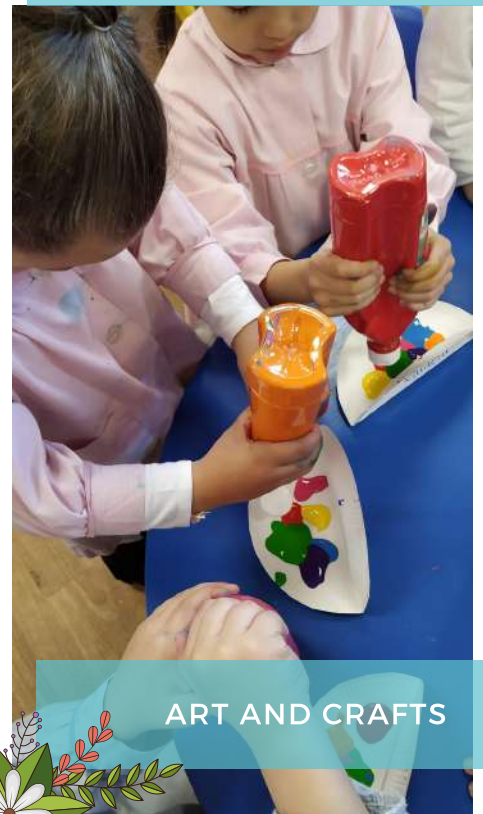
ART AND CRAFTS