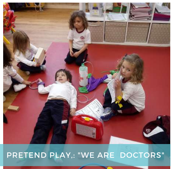
PRETEND PLAY,: "WE ARE DOCTORS"