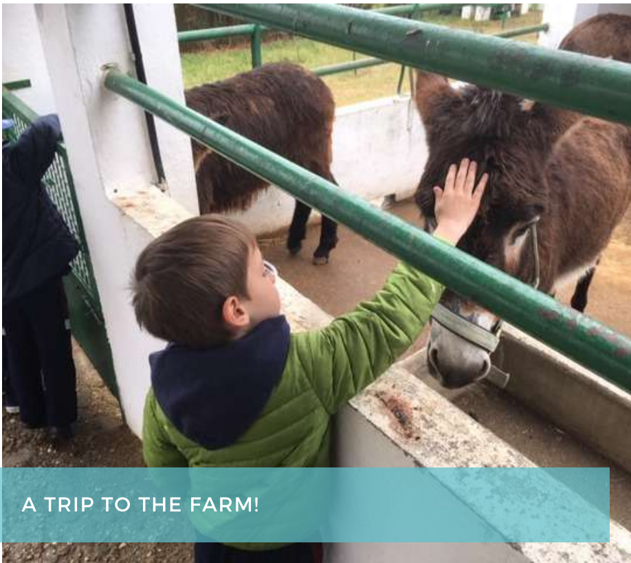
A TRIP TO THE FARM!